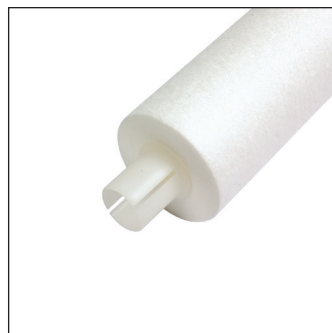
PP Core Extender