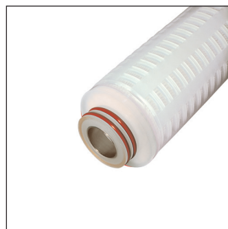
222 (w/SS Insert)