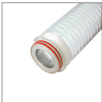
226 (w/SS Insert)