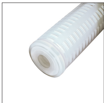
Flat (for 213)