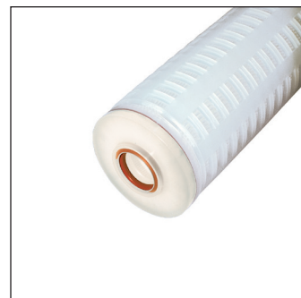
213 Internal O-Ring